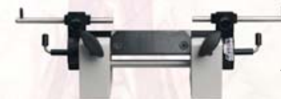
The Lever Release Feather™ Blade Holder

For users wishing to use both standard blades and Feather™ blades, a Lever Release Feather™ Blade Holder is available as an accessory.