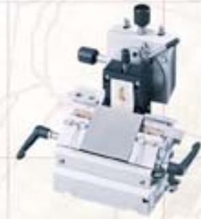
The Standard Knife Block

OTF 5000 cryostats are available fitted with either a standard knife block or with a Quick Release Feather™ Blade Holder. The Quick Release Feather™ Blade Holder can be quickly changed for the standard knife block and vice versa.