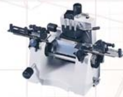
The Quick Release Feather™ Blade Holder